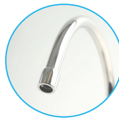
Faucet for use with Below-The-Sink Kit