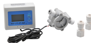
Monitor for use with Capacity Monitor Kit