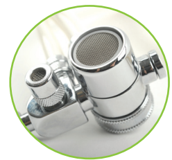
Diverter Valve for use with Countertop Kit