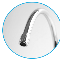
Faucet for use with Below-The-Sink Kit